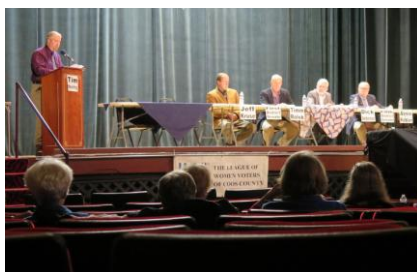
State Senate candidates for Districts 1 and 5 (photo at left)

Full information and directions will be in your December Voter.