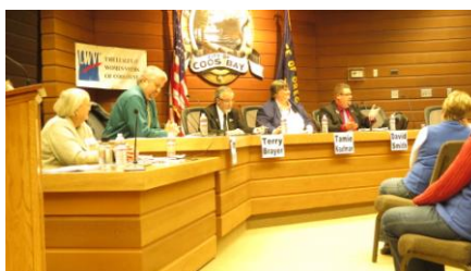
October 25, 2016, at Coos Bay City Hall LWVCC presented a candidate forum for Oregon State Representative, District 1 (upper photo) and District 9 (lower photo).